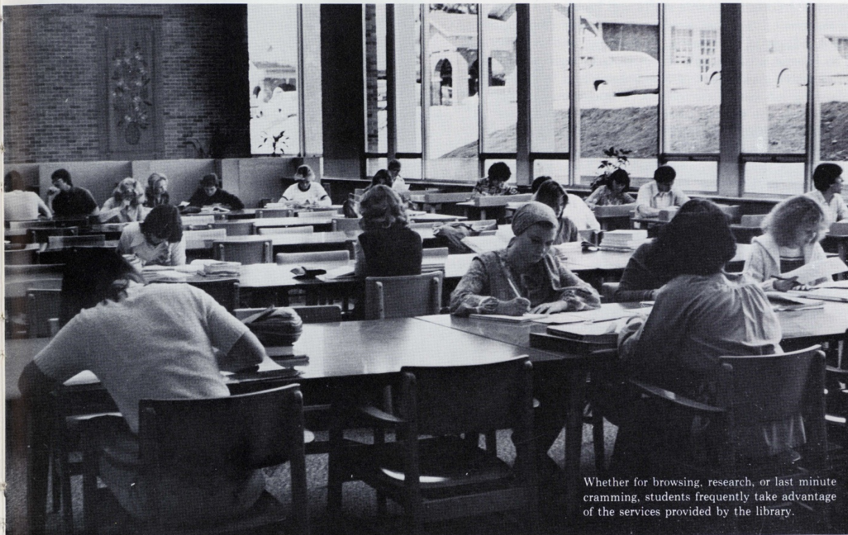
Whether for browsing, research, or last minute cramming, students frequently take advantage of the services provided by the library.