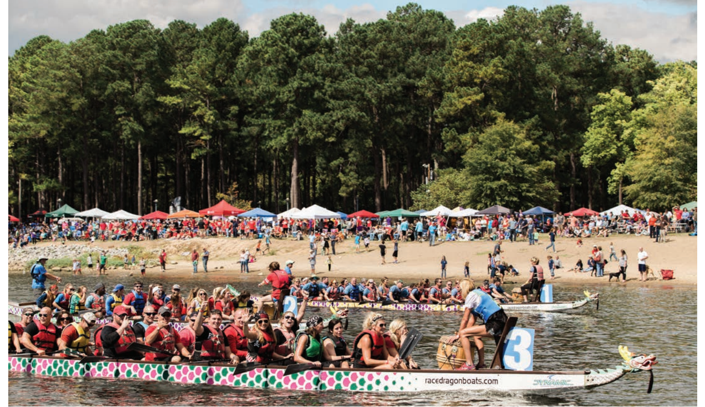
Paddles Up! Racers compete in dragon boats on the Tennessee River during the Shoals Dragon Boat Festival, a fundraiser benefitting UNA's Kilby Laboratory School.