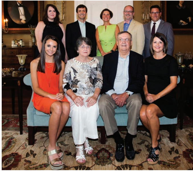
"Bibbee Family Endowed Scholarship" Signing