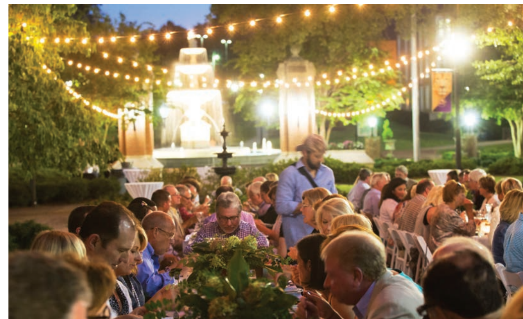
Participants enjoy great food and lively conversation at Lions Under the Lights, a fundraiser benefitting the UNA Office of Alumni Relations.