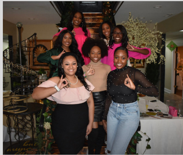
Charter Day Brunch - Sisterhood Event (Alpha Kappa Alpha Sorority, Inc.)