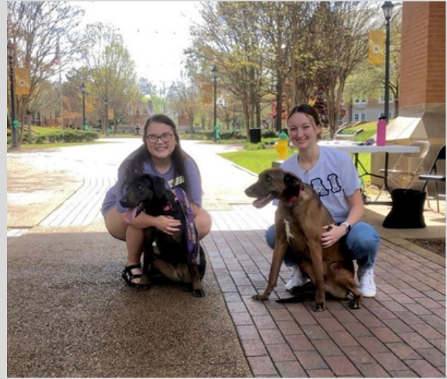
Canines, Cokes, and Jokes - Service Event (IGC)