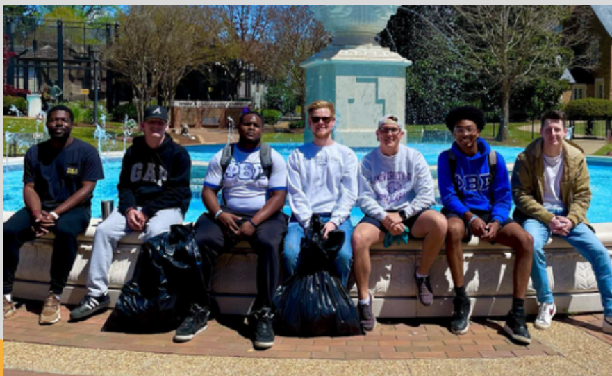
Clean-up Event - Service Event (Phi Beta Sigma Fraternity, Inc. & Pi Kappa Alpha)