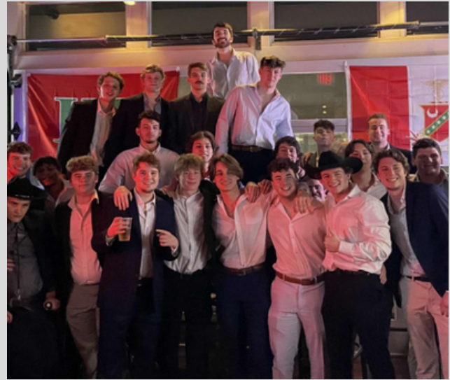
Semi Formal - Social Event (Kappa Sigma)