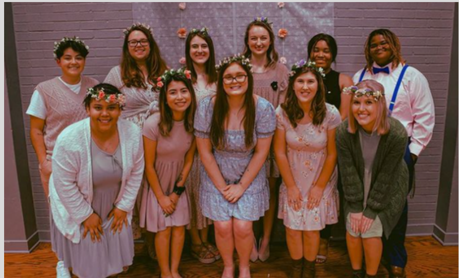
Bridgerton Formal Tea - Sisterhood Event (Sigma Alpha Iota)