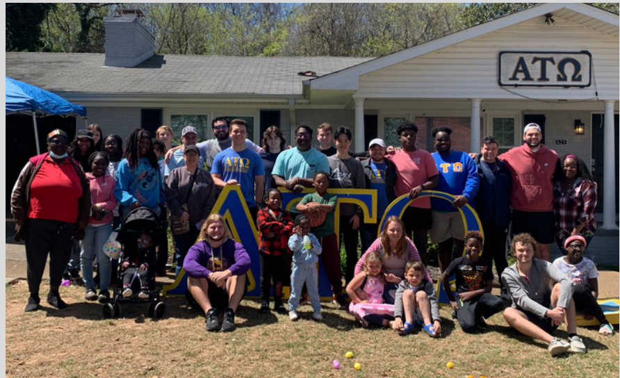
Easter Egg Hunt - Philanthropy Event (Alpha Tau Omega)