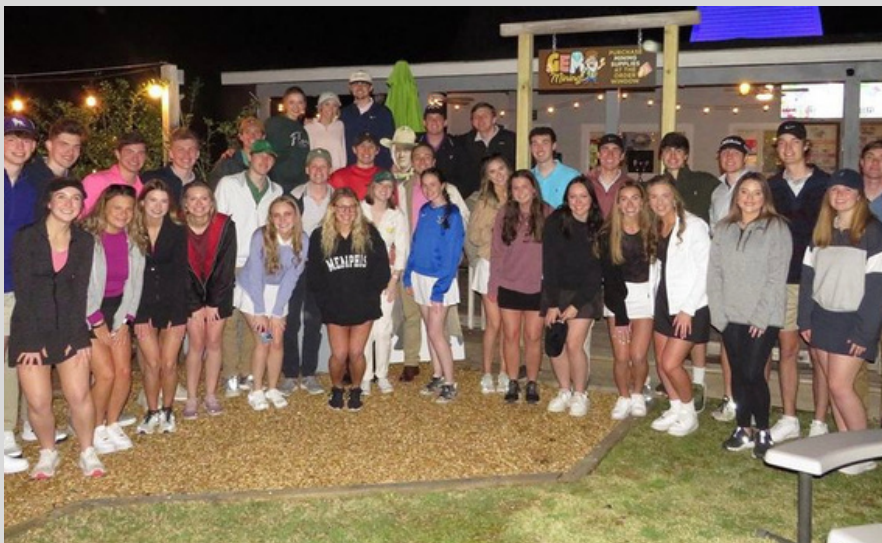
Mini Master - Social Event (Lambda Sigma Phi)