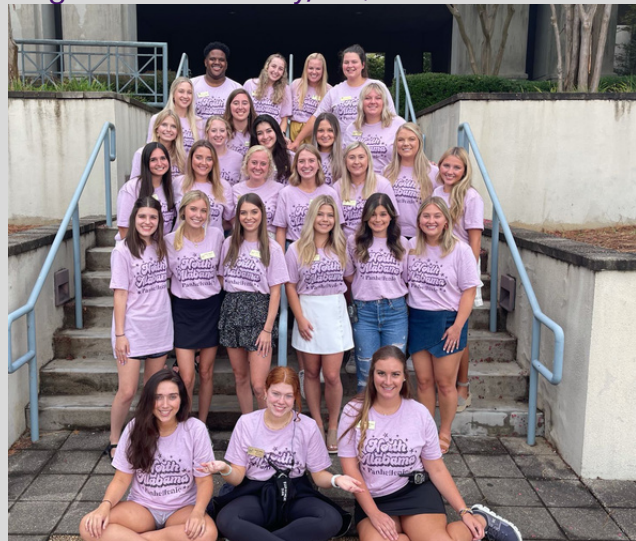
CPH Recruitment (CPH)