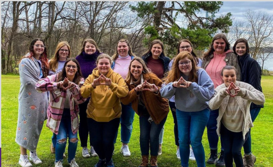
Grill N' Chill - Alumni Event (Alpha Delta Chi)