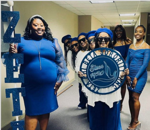
New Member Presentation (Zeta Phi Beta Sorority, Inc.)