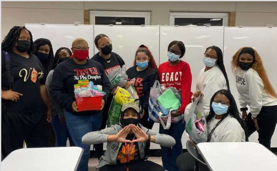
Know Your Rights: Traffic Stop - Educational Event (Delta Sigma Theta Sorority, Inc)