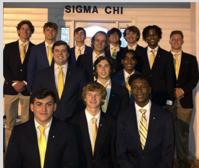
New Member Class (Sigma Chi)