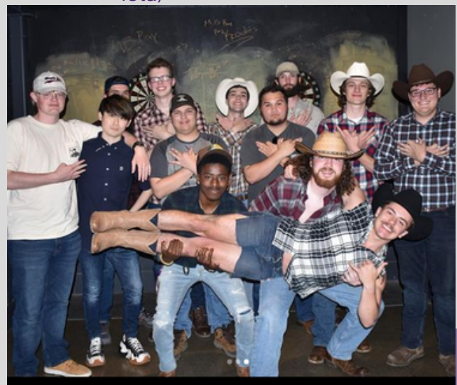
Date Party - Social Event (Alpha Sigma Phi)