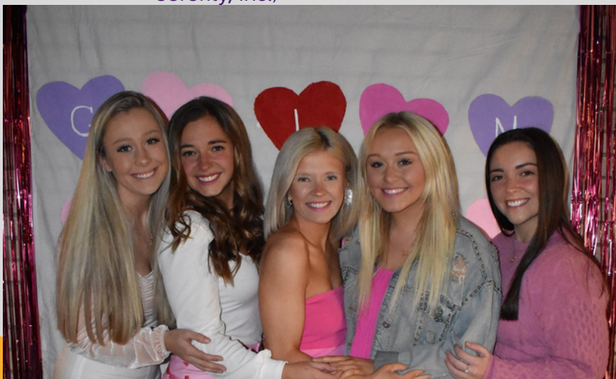
Valentines Day Mixer - Social Event (Zeta Tau Alpha & Phi Mu)