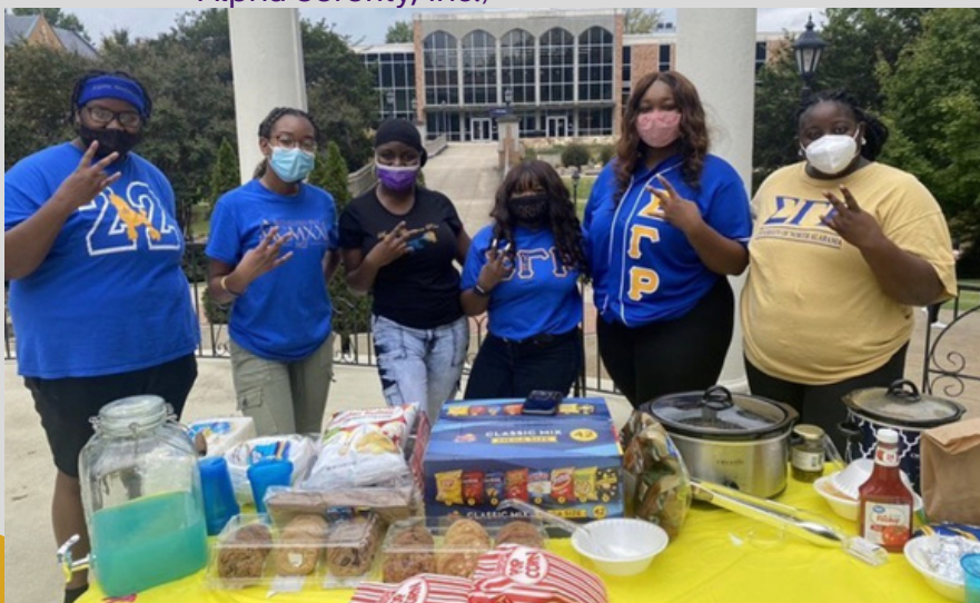
Poodle Concession (Sigma Gamma Rho Sorority, Inc.)