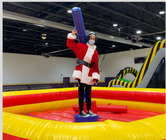
Christmas Fest - Social Event (NPHC)