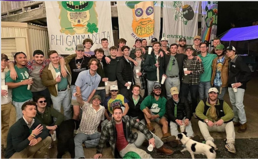
St. Patrick's Day Party - Social Event (Phi Gamma Delta)