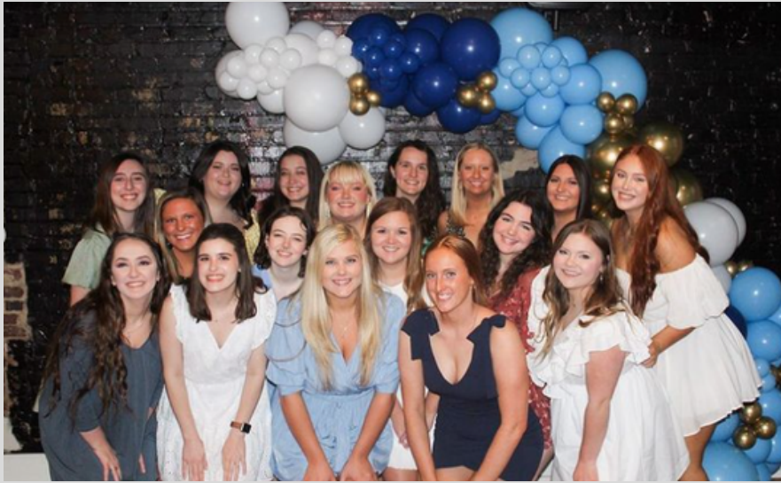
Senior Dinner - Sisterhood Event (Alpha Delta Pi)