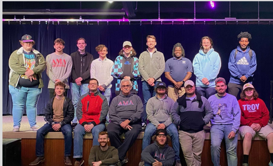
Phoenix Fest - Social Event (Alpha Mu Lambda)