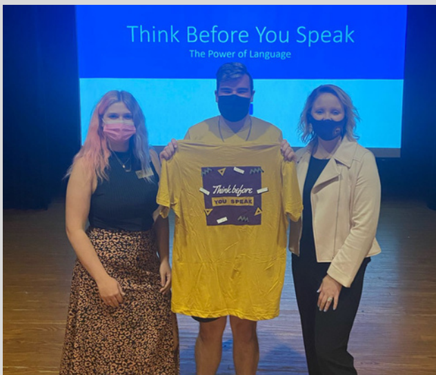
Think Before You Speak - Educational Event (IFC)