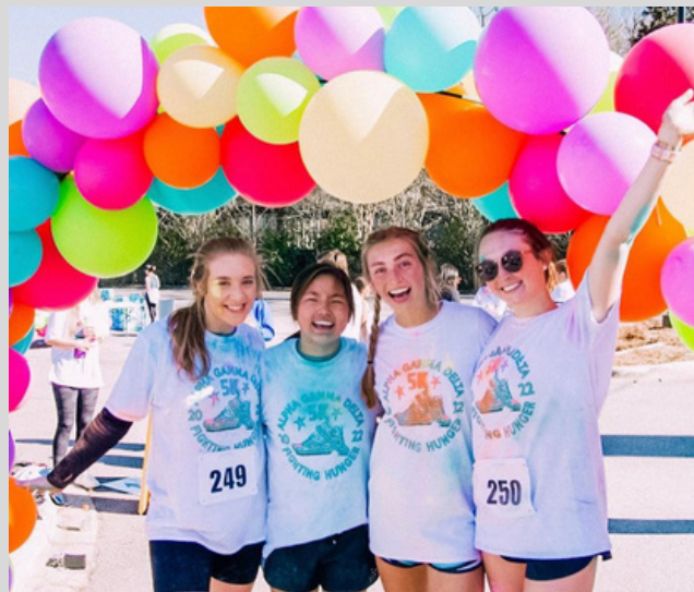
Color Run - Philanthropy Event (Alpha Gamma Delta)