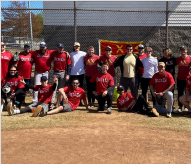
Softball Game - Alumni Event (Delta Chi)