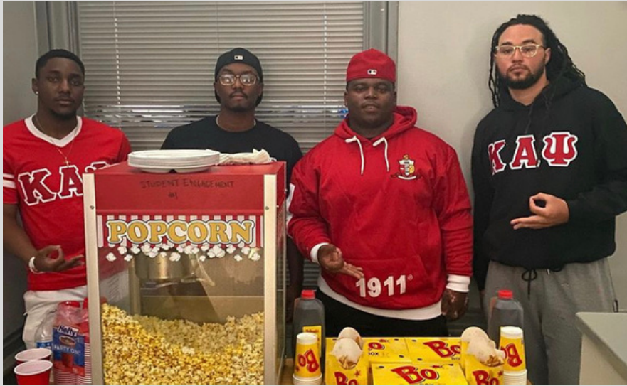
Movie Night (Kappa Alpha Psi Fraternity, Inc.)