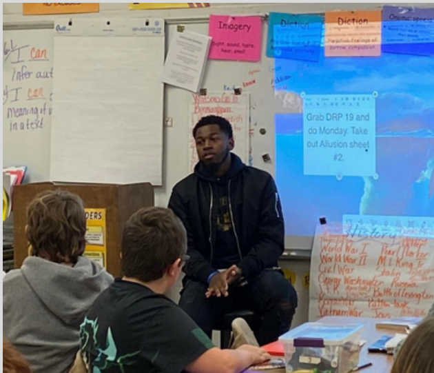
Classroom Talks - Service Event (Alpha Kappa Alpha Sorority, Inc.)