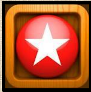
Letter School iPad app

One of their favorite centers is iPads where they work with an app called Letter School.