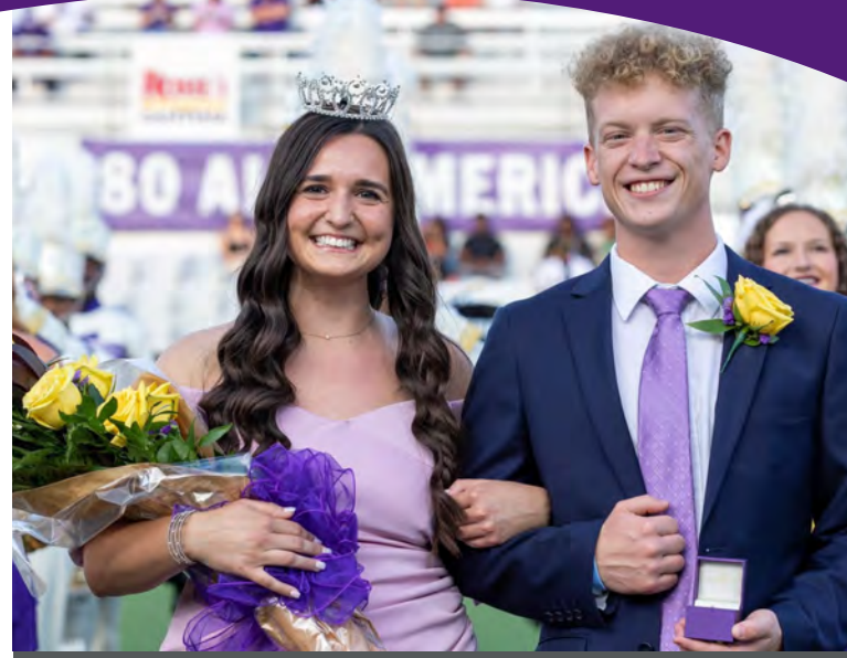
Homecoming elections are managed by SGA Elections and Recruitment. The theme was "Our TraD1tion Roars On"